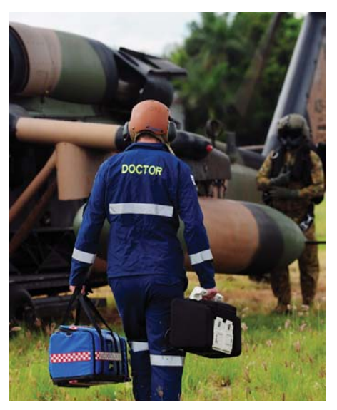
HEALTHY RELATIONS: Closer ties between Australia and Japan.

The treaty does not apply to offensive operations and specifically excludes the exchange of military equipment such as weapons systems or explosives.