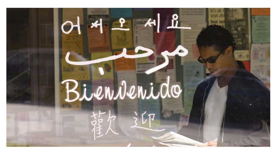
DEEPER UNDERSTANDING: Agreement sought on what multiculturalism means.