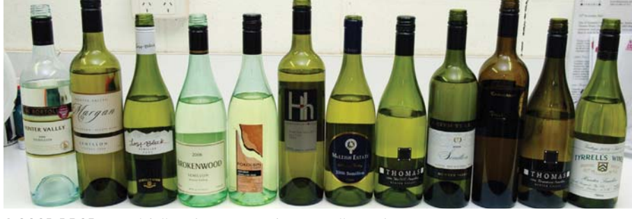
A GOOD DROP: Wine labelling changes expected to save millions.

www.aph.gov.au/senate/committee/le ctte le.committee@aph.gov.au (02) 6277 3419