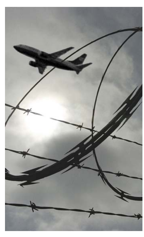
HOMECOMING: Jailed Australians could benefit from transfer treaty.

ustralians imprisoned in China could be able to come home under new agreements before parliament.