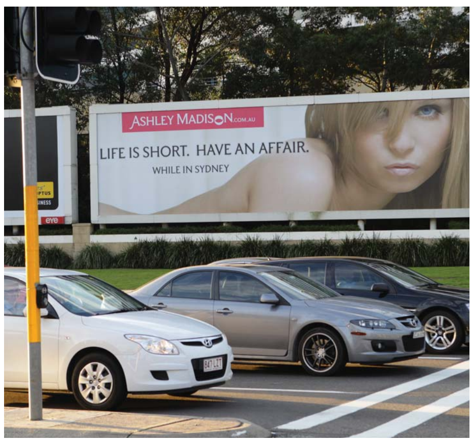
PROVOCATIVE: Controversial billboards have sparked community complaints.

Community concerns about billboards have led to a parliamentary inquiry.