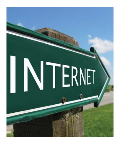
SIGN OF THE TIMES: NBN review considers costs and benefits.

"Experts agree that, while wireless is one part of the picture, it is not a substitute for fibre," Mr Albanese said. "If you are going to rely on wireless broadband, you need a fibre network to support it and you need mobile phone towers on every street connected up to each other in a system through the fibre network.