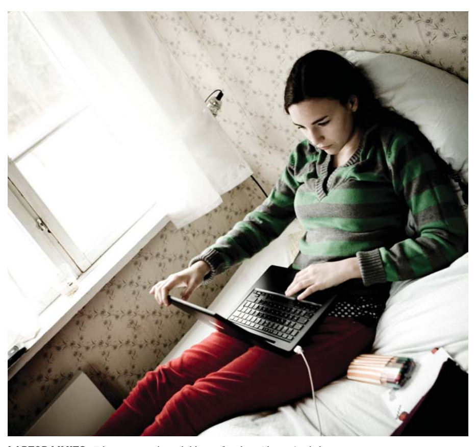
LAPTOP LIMITS: Filters may not keep children safe online.

Prohibition is not the best way to keep young people safe online, academics say.